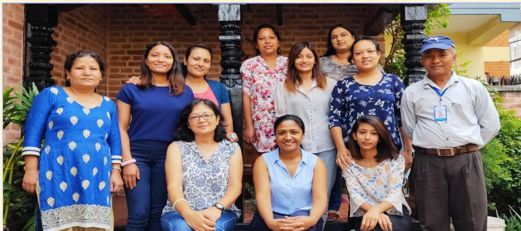
Ear Care Nepal Team