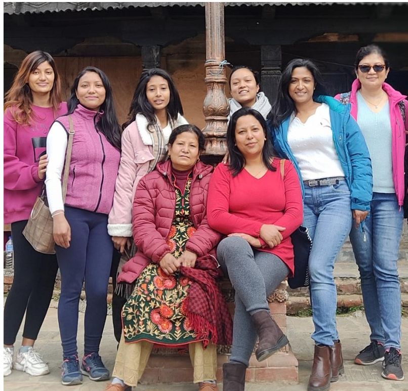
Ear Care Nepal Team

Samsara Nepal continued their support by sponsoring Female Community Health Volunteer training program & school ear health program. Samsara Nepal also continued to support disabled children and a teacher for blind of Disable Service Association, Bungamati, Lalitpur.